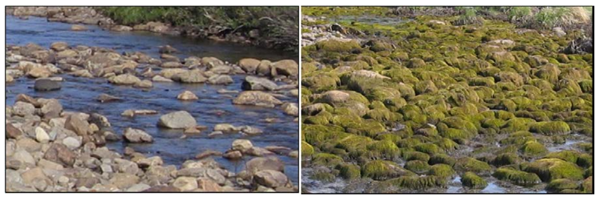
Photos showing the difference in bottom coverage between the diatom state (Photo A, left) and the fertilized moss state (Photo B, right).

In another study, long-term nutrient enrichment produced an unanticipated trophic decoupling whereby enrichment continued to stimulate primary consumer production without a similar increase in predator fish. The majority of the increased ecosystem productivity was confined to lower trophic levels because the long-term enrichment primarily stimulated primary consumers that were relatively resistant to predation. Based on these results, the authors concluded that "even in ecosystems where energy flow is predicted to be relatively efficient, nutrient enrichment may still increase the production of non-target taxa (e.g. predator or grazer resistant prey), decrease the production of higher trophic levels, or lead to unintended consequences that may compromise the productivity of freshwater ecosystems" (Davis et al. 2010 p 124).